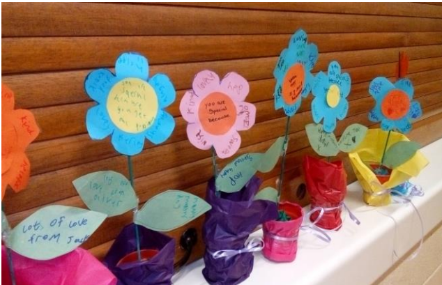
Mother's Day Craft for 'Someone Special'