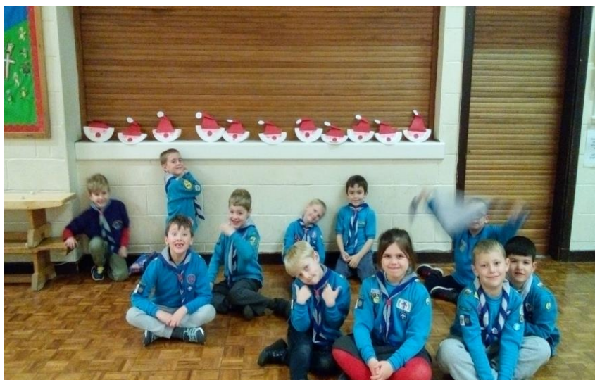
1 st Henllys Beaver Scouts – Wednesday

Wednesday Beavers have enjoyed a variety of activities; games; craft and adventure